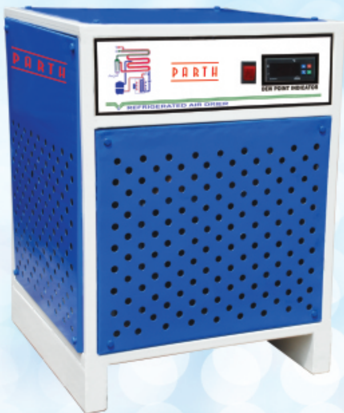
▲ REFRIGERATED AIR DRIER