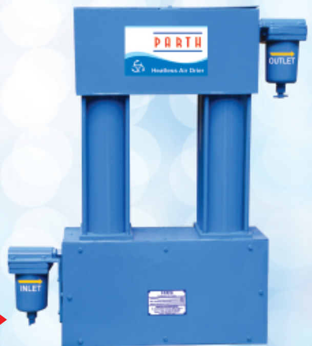
COMPACT HEATLESS AIR DRIER ▶